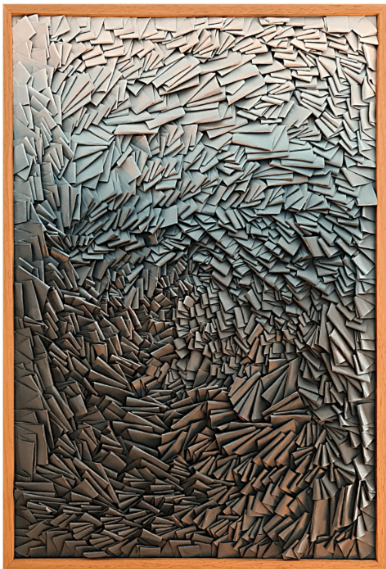
The Spirit of Nature