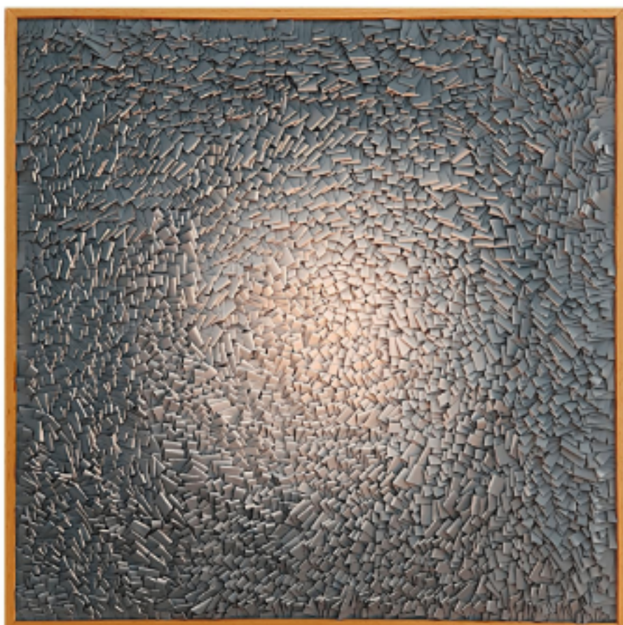
The whispered of someone's heart

In his reflective artist's statement, Franzão delves into the distortions that permeate urban landscapes and the contemporary societal values that shape our world. His artistic lens skillfully captures and elevates the often fragmented details within mixed media art. With an innovative approach, he seamlessly unites two-dimensional and three-dimensional effects, forging a delicate synergy that gracefully reconciles form and colour, light and shadow, as well as movement and inertia.